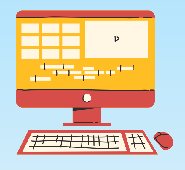
WEBSITE WITH RESOURCES