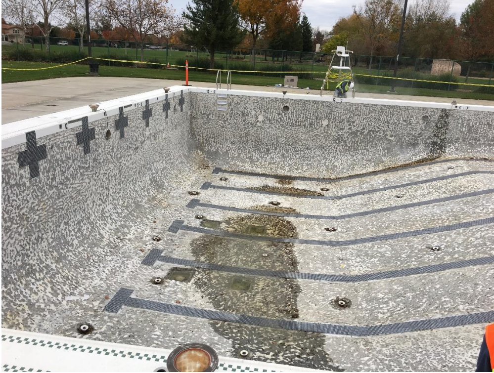
Arroyo Lap Pool