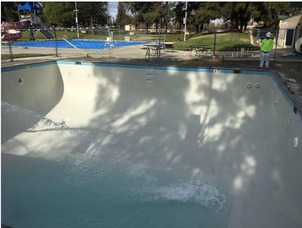
Manor Dive Well