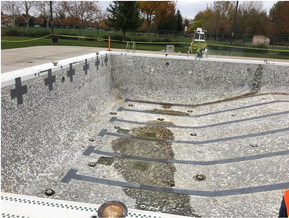
Arroyo Lap Pool