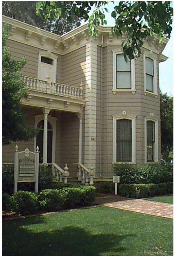
Hunt Boyer Mansion located at 604 2 nd street.