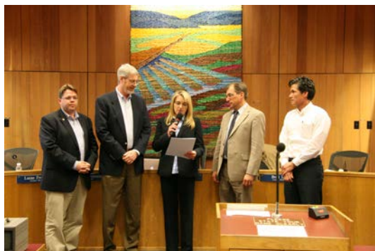
2013-2014 Davis City Council