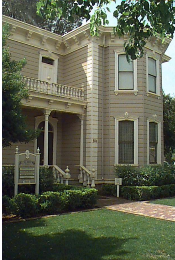
Hunt Boyer Mansion located at 604 2 nd street.