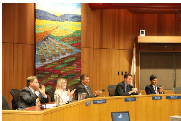
2013-2014 Davis City Council