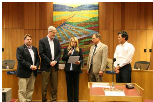
City and techDAVIS Partnership