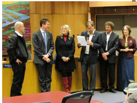
Business of the Year Awards