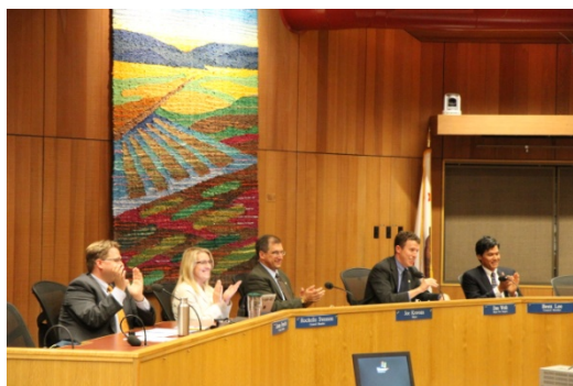
2012-2014 Davis City Council