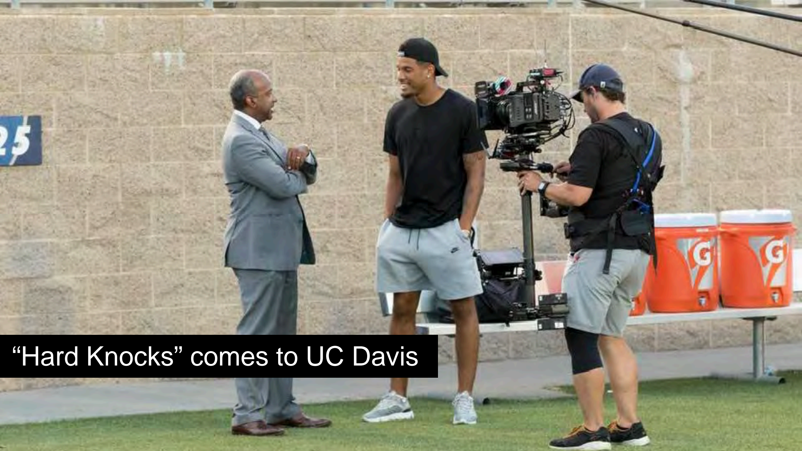
“Hard Knocks” comes to UC Davis