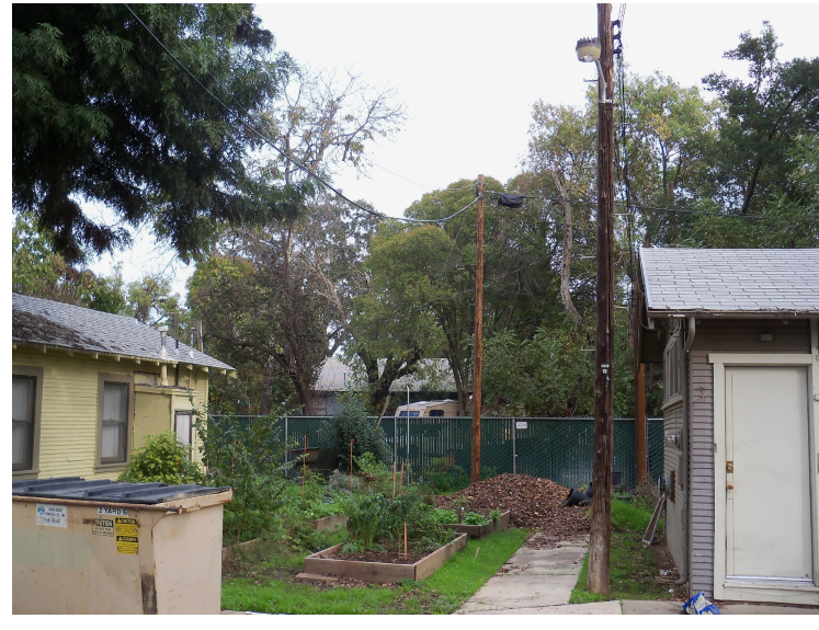
VIEW FROM SLATTER'S COURT EXISTING