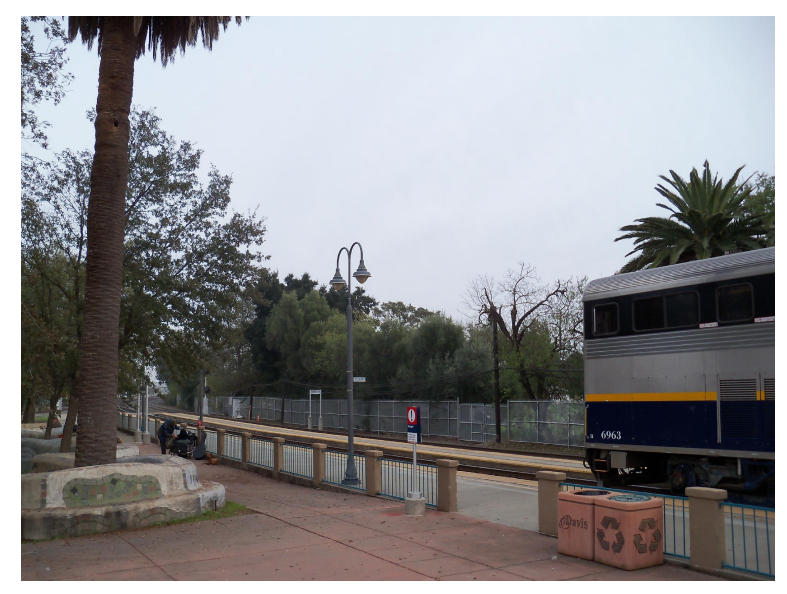
VIEW FROM TRAIN DEPOT - EXISTING