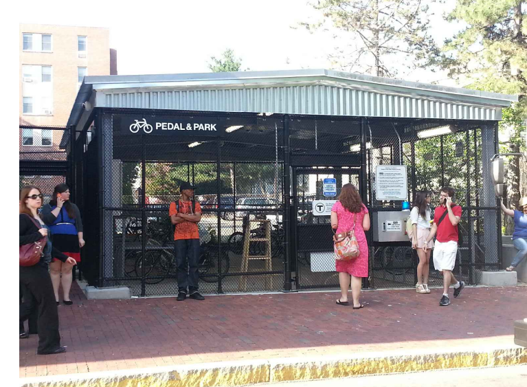
LONG-TERM COVERED AND SECURE BICYCLE PARKING CORRAL EXAMPLE